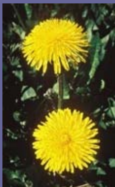
Dandelion Flower Essence

The following Essences are 25% off for the month of JUNE.